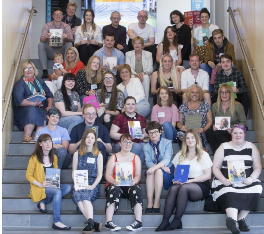
Care-experienced students (including OUiS students) from Scottish universities at an event with the First Minister, July 2019.

Scottish Funding Council, National Ambition for Care-experienced Students, 2020