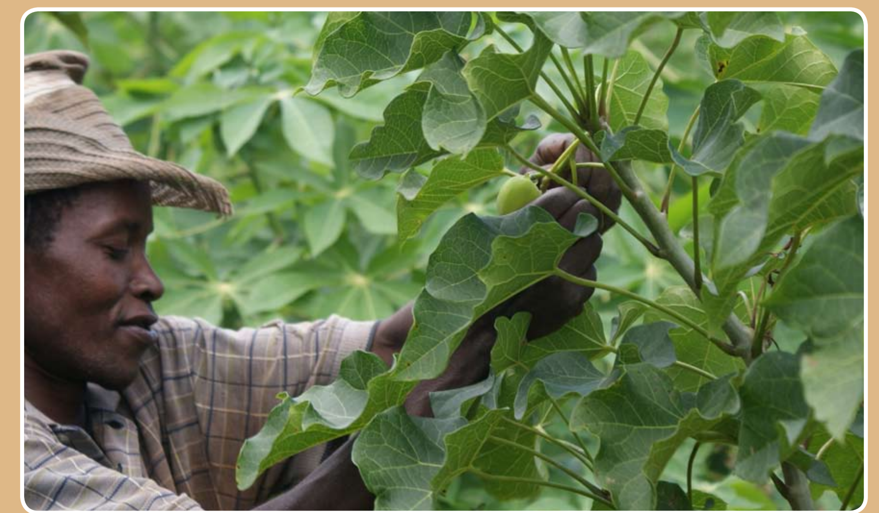
Farmer harvesting Jatropha fruits