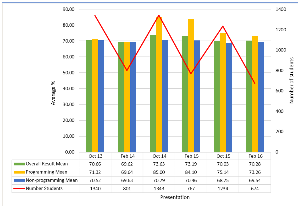
Figure 1 Comparison of mean scores for the programming question and the scores for the other non-programming questions, for the six presentations

elements, and vice versa. Therefore, results from the statistical data analysis suggest that there is no significant difference in levels of engagement between these tasks, and it appears that success, or otherwise, in one type of task is a good predictor of engagement with the other task.