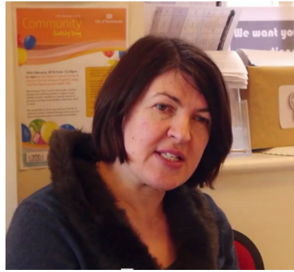
London Early Years Foundation (UK)