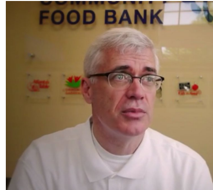
Atlanta Community Food Bank (USA)