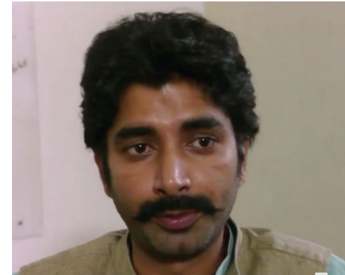
Million Kitchen (India)