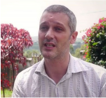
Azzi Life (Rwanda)