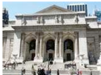
New York Public Library