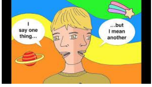
Figure 2: 'I say one thing but mean another'

In your own communications be as explicit as possible. For example, if expecting students to complete a task, it is better to state what exact outcomes you require, e.g. rather than saying "Research X topic", say "Spend thirty minutes reading about X topic and write down some notes summarising your reading." Executive functioning can be difficult for many autistic people, so being clear about how long tasks should take is beneficial.