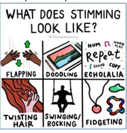
Figure 3: Stimming

anxious or feeling under pressure. Stimming is a repetitive action that can calm or sooth; whilst many non-autistic people will stim by fiddling with pens or their hair, autistic people may exhibit more unusual actions, with common stims including flapping hands, rocking, rubbing a leg or arm, spinning, or repeating specific words or phrases. Stimming is extremely normal, and educators in a classroom environment should ensure that autistic students feel comfortable if they do need to stim, and that other students don't feel threatened or concerned if one of their peers stims. Specifically, you should not try to stop or distract a person from stimming as this will usually increase their anxiety.