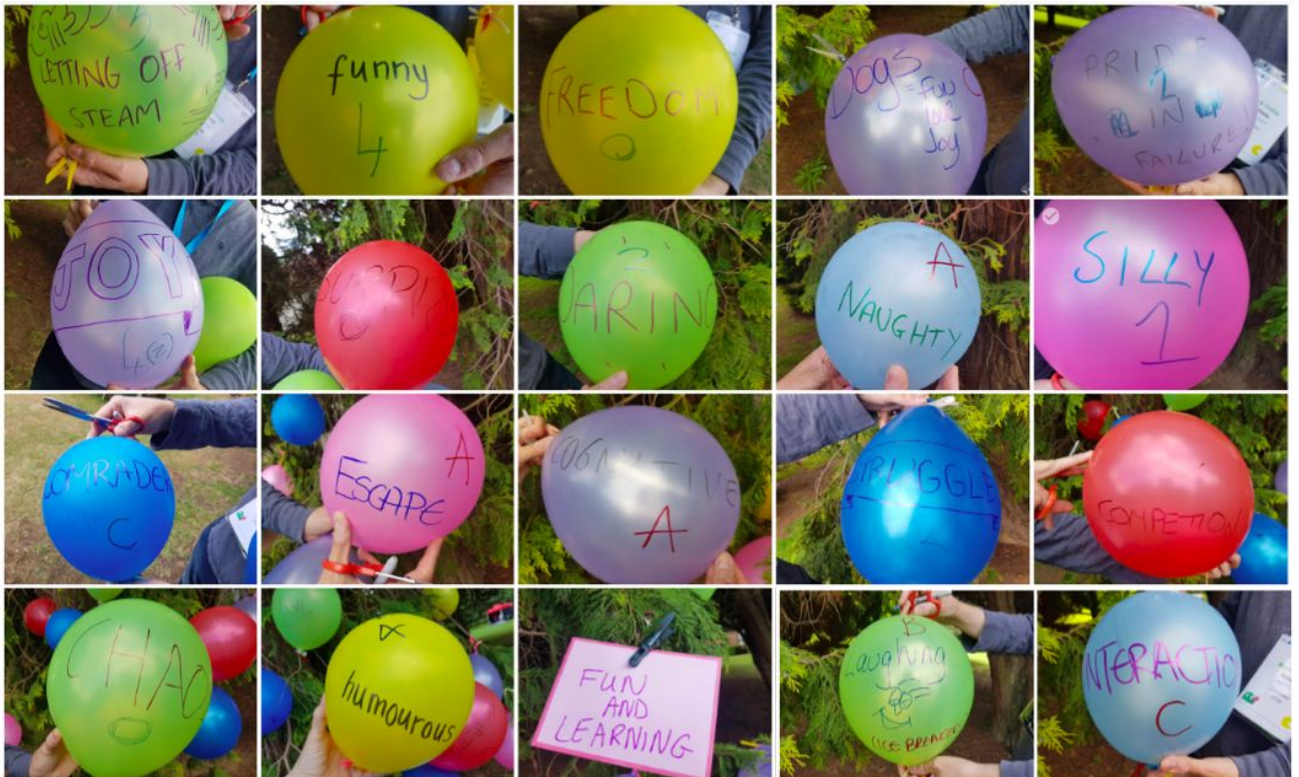
Appendix B (dataset: Fun and Learning)