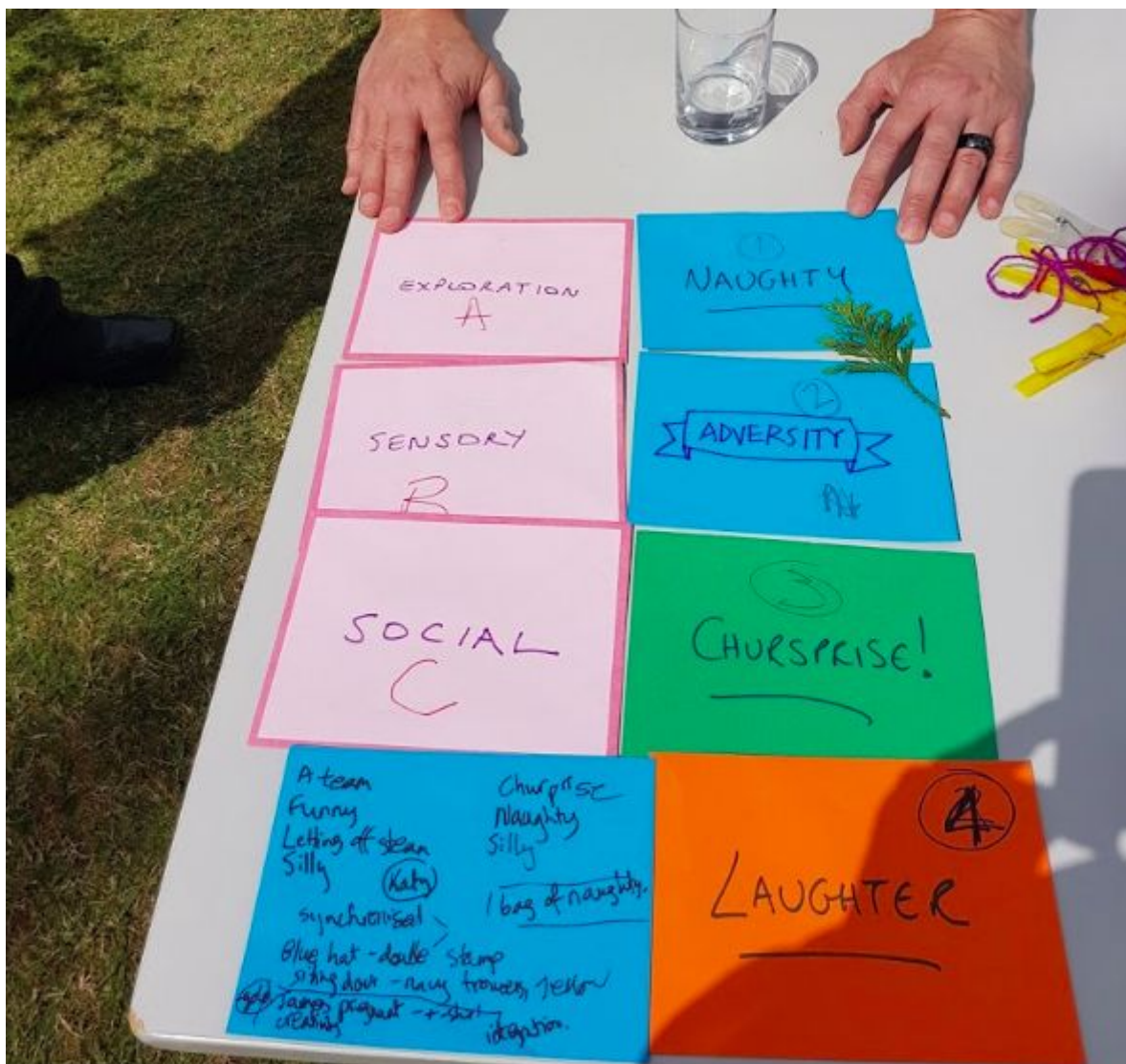
Appendix C (Thematic Analysis)