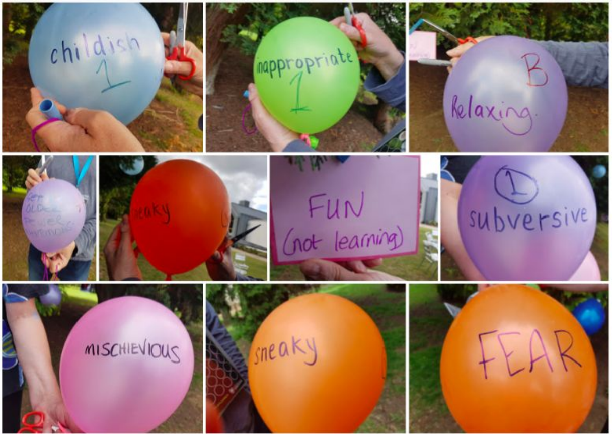
Appendix A (dataset: Fun not Learning)