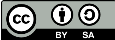
CC-BY-SA (ATTRIBUTION – SHARE ALIKE)

CC-BY IS THE MOST PERMISSIVE LICENCE. CONTENT CAN BE USED IN ANY MANNER; REMIX IT, ADAPT IT, DISTRIBUTE IT, BUILD UPON IT. USED FOR MAXIMUM DISSEMINATION.