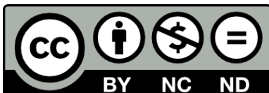
CC-BY-NC-ND (ATTRIBUTION – NON-COMMERCIAL – NO DERIVATIVES)

CC-BY-ND LICENSED CONTENT ALLOWS YOU TO DISTRIBUTE IT ONLY IN ITS ORIGINAL FORM. ADAPTING THIS CONTENT IS NOT PERMITTED.