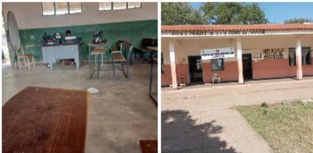
Empty registration posts in Massingir, Gaza

According to some supervisors, in past registrations, at this time, towards the end of the registration period, the voters appeared en masse, and long queues were formed.