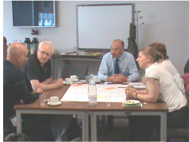
1. Reflect and understand